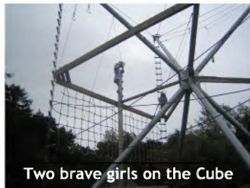
Two brave girls on the Cube

Sunday was not so kind: it was on with the raincoats and trainers as we made our way to the Cube course (a very large climbing frame). After getting all geared up with helmets and harnesses, the brave Brownies were climbing up like monkeys while we leaders cheered them on in admiration. On to the Abseiling we went and again there was no shortage of enthusiasm, "Can we have another go, please?" Bringing our muddy shoes, we made it