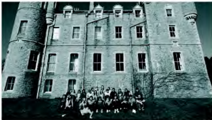
Most of the group at Castlewellan!!