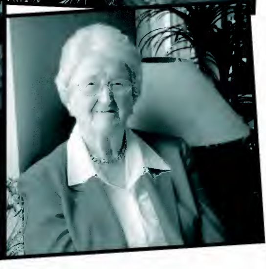
Glenada 25 - 28 May 2010