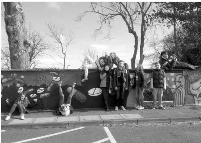
Having a rest during a hard day of work at the wall in Kilcooley Square