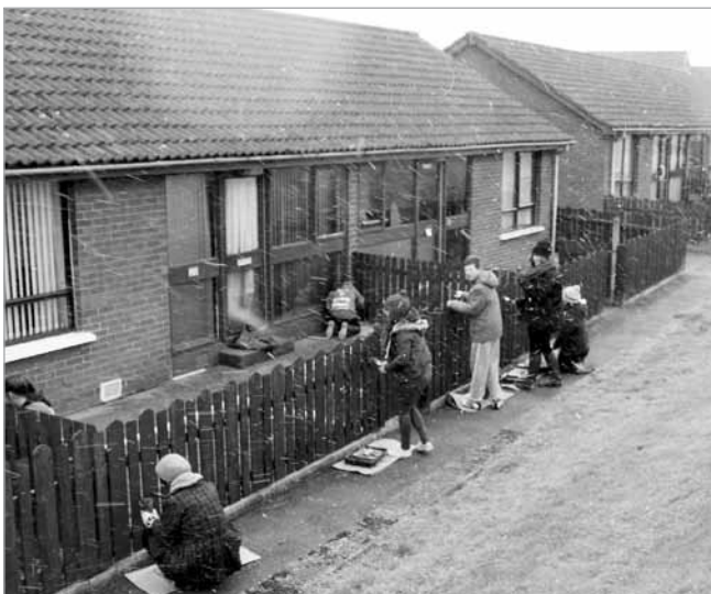
Young people painting a resident's fence in Kilcooley

"YOU DON'T THINK YOUR WAY INTO A NEW KIND OF LIVING, YOU LIVE YOUR WAY INTO A NEW KIND OF THINKING."