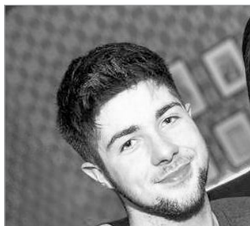
Table Tennis News

Our membership now stands at 23, made up of all ages. In fact, the expression 7 to 70 doesn't quite cover the age range of our club! On a normal night, we have three tables going constantly. When you have finished your three games, you barely have time to sit down for a drink of orange juice before you are due on again, but the giggles and laughter are testament to the enjoyment we all get from our Monday evenings.