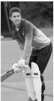
Beaver Prize Giving