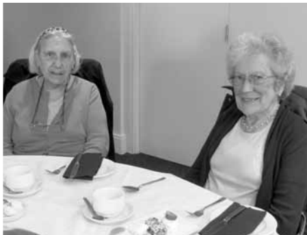
Wednesday Club Afternoon Tea