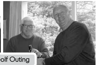
Parish Golf Outing