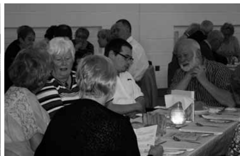
Coffee, Cake and Art Sale