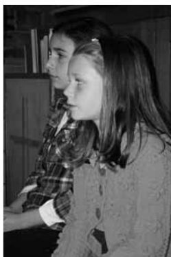
Harvest Children's Church and Coffee Time