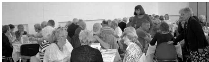
Parish Harvest Lunch