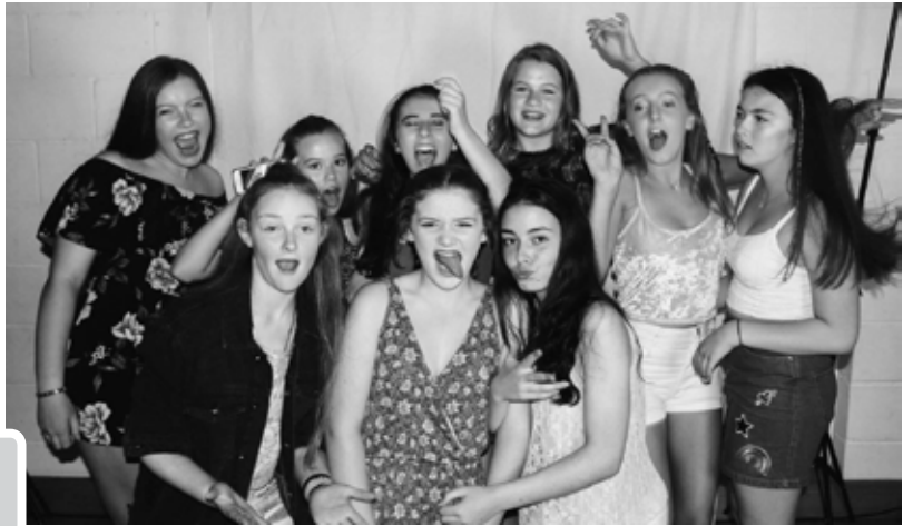
X-Cess & Jumpin