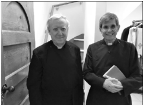
Holy Week Evening Services