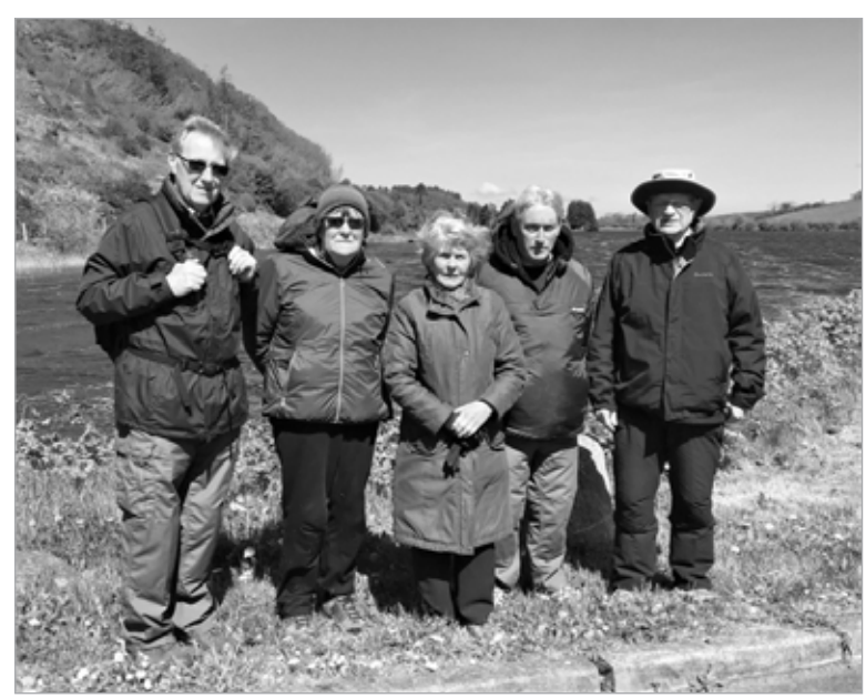
As we returned home after a glorious day in St Patrick's country, we stopped at McCann's of Balloo for refreshments.