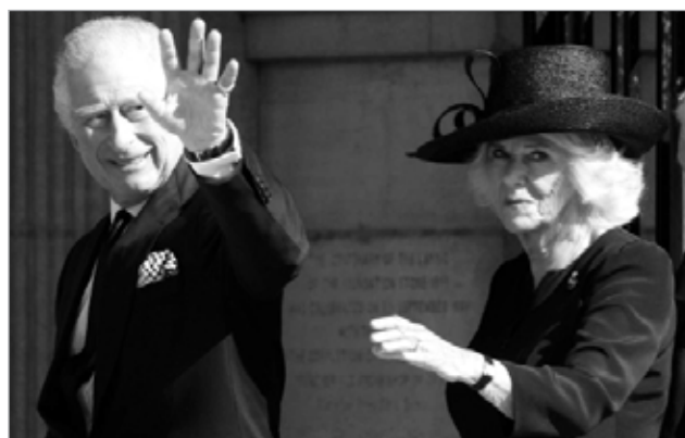
(King Charles and Queen Camilla arriving at St Anne's Cathedral for the Queen's thanksgiving service)

Blessed are you, Lord Jesus, for as you were sent by the Father, so you send us. Equip Charles our King and all your people with the gifts to fulfil our calling, that we may love as you loved, serve as you served, and willingly follow wherever you lead. Blessed be God, Father, Son, and Holy Spirit. Amen