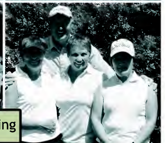
Parish Golf Outing