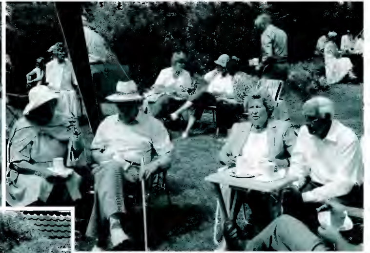
Parish Garden Party