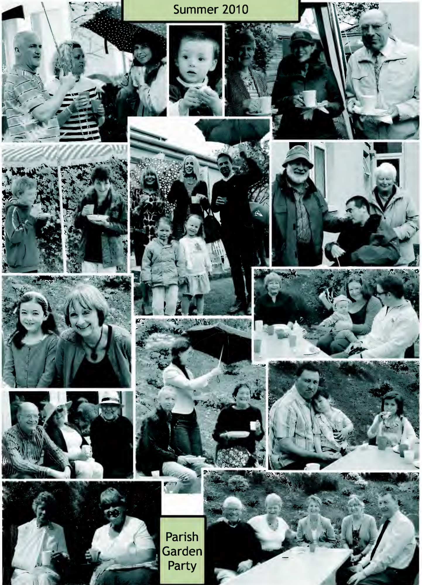
Parish Garden Party